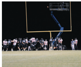
The extra point kicked by Jackson Patillo is good! The Tigers won the homecoming game against Central 28-20.